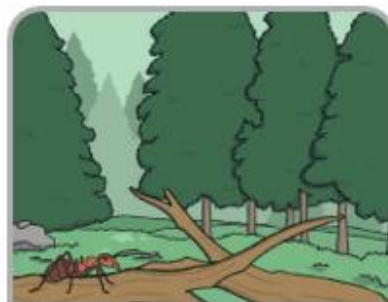
inside rotting wood