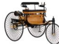
The motor car – 1885