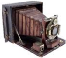
Photographic Cameras – 1838