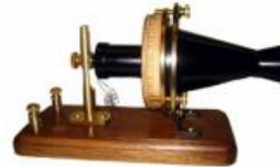
The Telephone – 1876