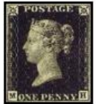
Postage stamps - 1840