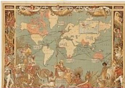
How the British Empire was seen at the time