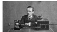
The radio -1895