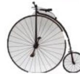
The Bicycle – 1880s