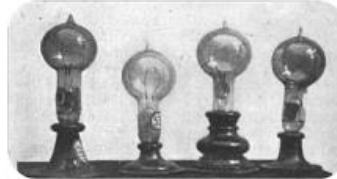
The electric light bulb - 1879