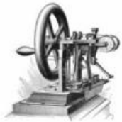
The Sewing Machine - 1845