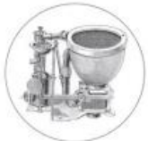
The flushing toilet - 1851